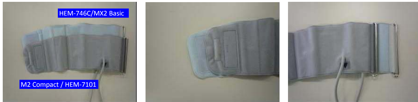
Fig1 Size comparison

The actual size of these cuffs is same (Fig1).