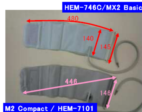
Fig2 Measurement point

Regarding to longer dimension, the measurement point was different. For difference between M2 Compact / HEM-7101 and MX2 Basic, the 1mm difference is caused by treatment of edge of cuff. We consider this as cloth cover change (Fig2).